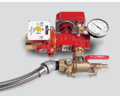
UM Universal Manifold

The UM/UMC is engineered with space savings in mind for those commonly installed applications in stairwell landings and small alcoves. All UM/UMC assemblies include the NFPA 13 required listed pressure relief valve, test and drain valve and pressure gauge.