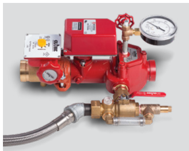
UMC Universal Manifold Check