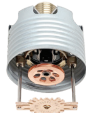
RC-RES 5.8K (SS8561)