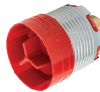
Red - 162°F Ordinary