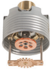
RC-RES 3.0K (SS8361)