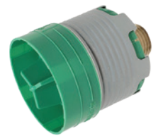
Green - 205°F Intermediate